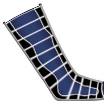
Twelve Overlapping Chambers