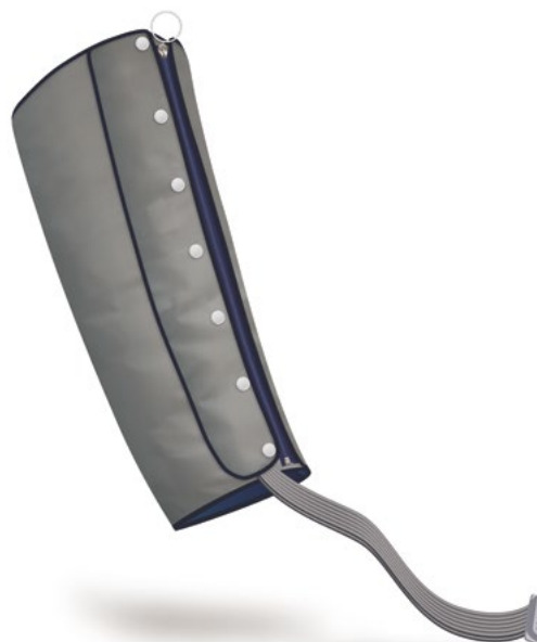
Twelve Chamber Arm Garment