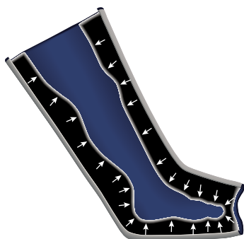
Consistent Inward Pressure

Inserts can be used to accommodate larger limbs. The overlapping chambers under the 'zip in' inserts provide total circumferential compression which assists in the effective transport of fluid.