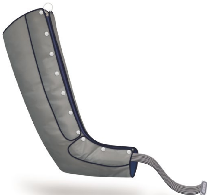
Twelve Chamber Leg Garment