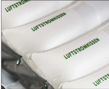
polyurethane ventilation air cells