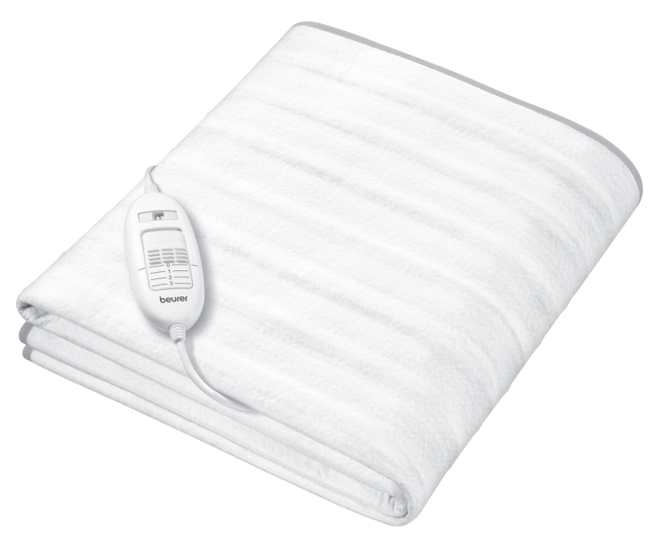
EN Heated underblanket Instruction for Use