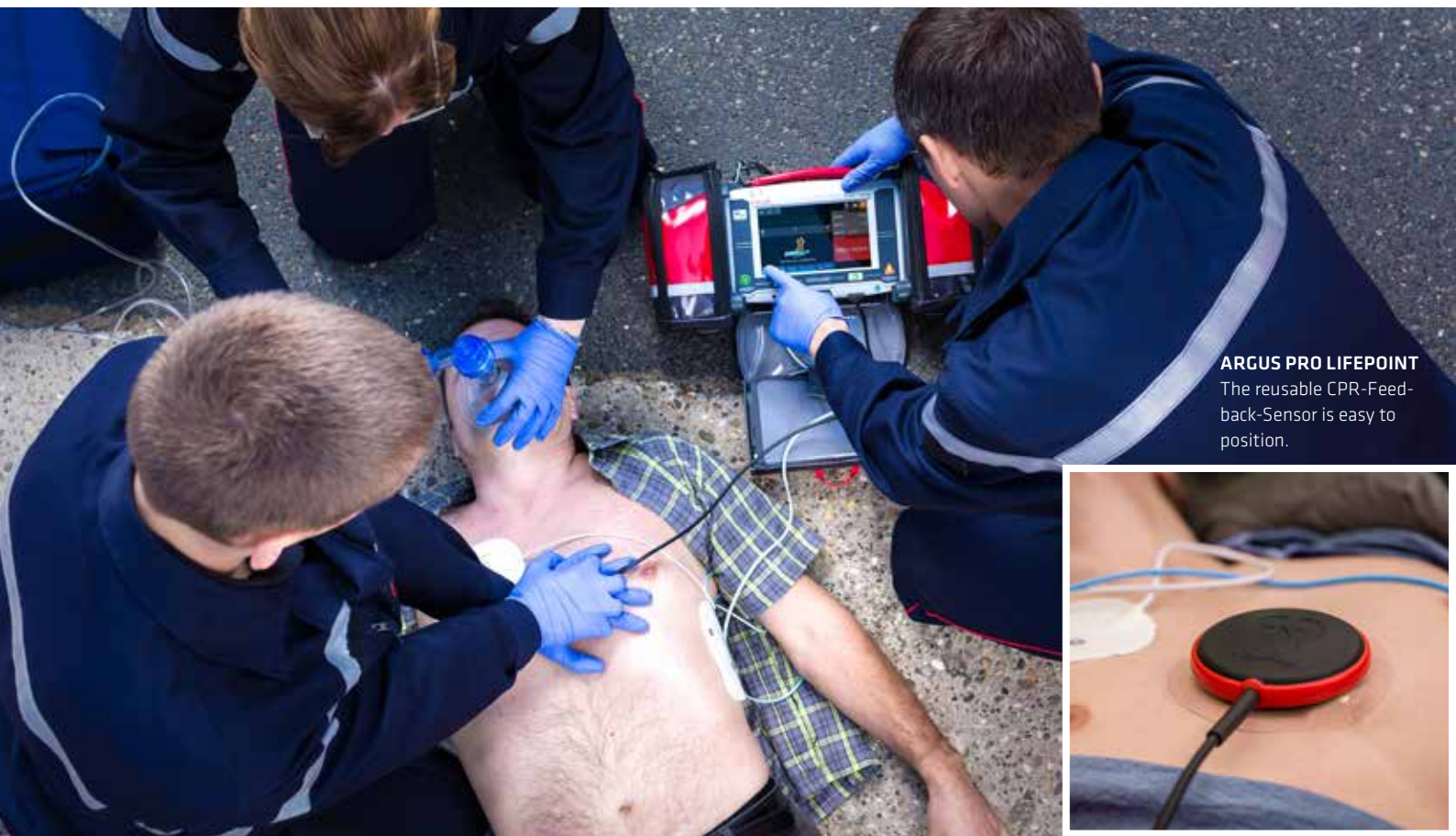
ARGUS PRO LIFEPOINT The reusable CPR-Feed-back-Sensor is easy to position.