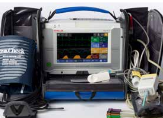
PHYSIOGARD TOUCH 7 MONITOR