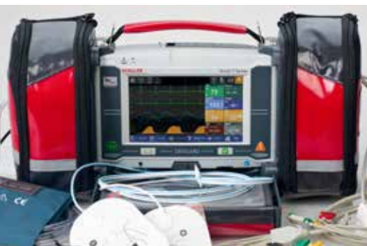
DEFIGARD TOUCH 7 MONITOR / DEFIBRILLATOR

The DEFIGARD Touch 7 and PHYSIOGARD Touch 7 (DGT7/PGT7) are indispensable tools for rescuers. In a defibrillator/monitor or only monitor version, the device is extremely compact and offers the latest defibrillation technology in combination with comprehensive monitoring functions. It is the first emergency monitor/defibrillator equipped with a touch screen – making it the most intuitive device on the market – as well as with the latest data transmission technology.