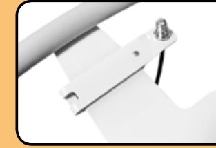
ACC-OBS-084 Team3 Aerial bracket/cable