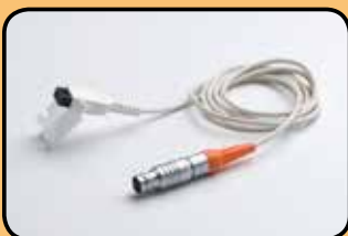
ACC-OBS-042 SPO2 cable connector (Metal connector)