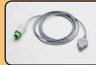
ACC OBS 067 FECG Leg Plate Adaptor, Eziplug