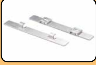
ACC-OBS-050 freedom mounting sytem (FM800E monitor only)