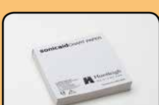
ACC-8400-8003 Standard grade chart paper (Box of 20 packs)