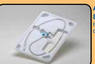
ACC-8400-8011 Intran Plus IUP catheter (box 10)