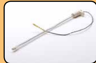
ACC-OBS-011 Philips Fetal Scalp Electrode Double Helical (Box of 25)