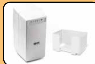
* ACC-OBS-060/062 UPS/BIN kit 230V/120V