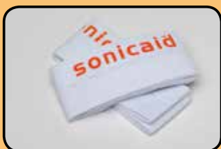
ACC220 Latex free- Disposable transducer belts (box of 100)