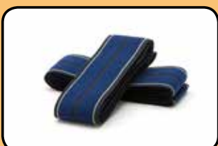
ACC-MI1136 Latex free Reusable transducer belts (pair)