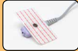
ACC-2464AA0 Qwik Connect Reference Electrodes (box of 50)