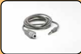
SP-7775- 6901 Patient Event Marker