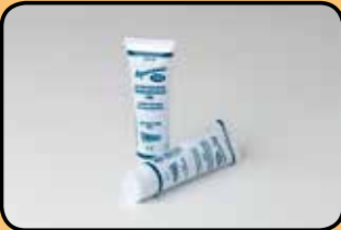
ACC24 Ultrasonic Gel - (box 12 x 60ml tubes)