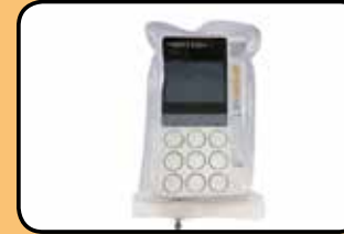
ACC-OBS-080 Splash Proof (IPX) doppler Pouch