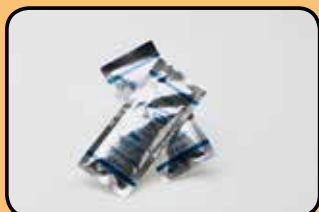
ACC-1300-0145 Aquasonic Gel 20gm sterile sachet (pack of 48)