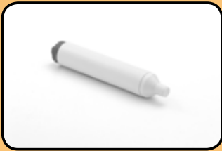
VP8XS 8MHz Vascular probe -audio only