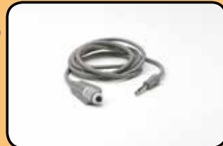
SP-7775-6901 Patient Event Marker