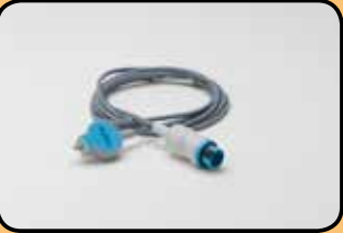
ACC- 900X533 Eziplug FECG connection lead (Team IP only)