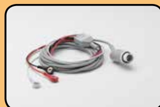
ACC-OBS-024 Maternal ECG lead