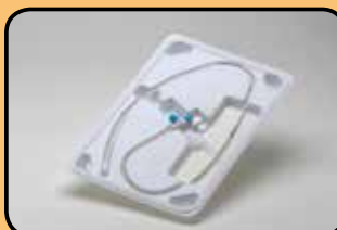
ACC-8400-8011 Intran Plus IUP catheter (box 10)