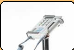
ACC52 Doppler Stand D920/D930 / FD range Dopplers only)