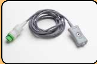
ACC OBS 069 FECG Leg Plate Adaptor, Philips