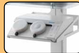
ACC-OBS-082 Trolley Mount Kit