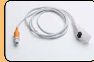
ACC-OBS-071 SpO2 cable con- nector