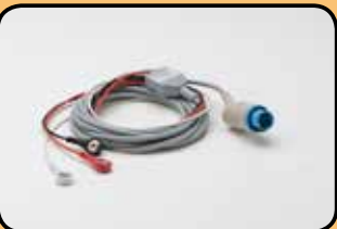
ACC-8402- 6969 Maternal ECG lead (TeamIP only)