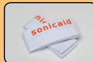
ACC220 Latex free- Disposable transducer belts (pack of 100)