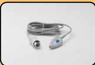
ACC-OBS-022 Safelinc FECG connection lead