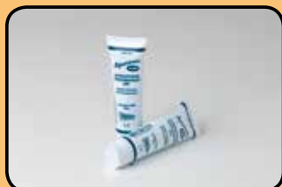
ACC24 Ultrasonic Gel - (box 12 x 60ml tubes)