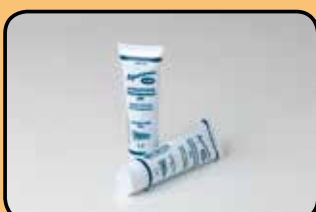
ACC24 Aquasonic Gel- (box of 12 x 60ml tube)