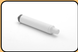
VP4XS 4MHZ Vascular probe -audio only