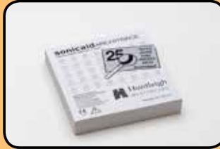
ACC-321414 Architrace 25 year archival chart paper (Box of 20 Packs)