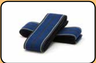
ACC-MI1136 Latex free reusable transducer belts (pair)