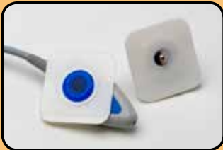
ACC-900X260 Safelinc/Eziplug reference elec- trodes (box of 50)