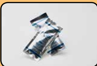
ACC-1300-0145 Aquasonic Gel 20gm sterile sachet (packs of 48)