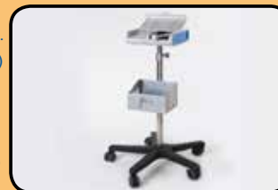
ACC180 MD200 Doppler stand