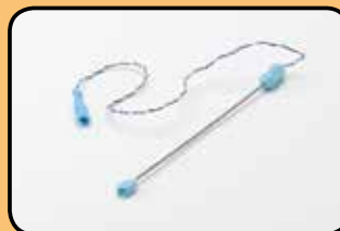
ACC-900X534 Eziplug FECG Copeland Style electrode (box of 25)