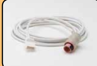
ACC-8400-6937 Intran Plus (IUP) Interconnecting Lead