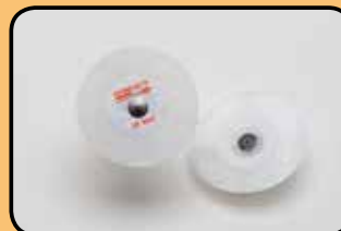
ACC-OBS-027 PHILIPS Maternal ECG skin electrodes (Box of 300)