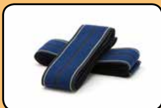
ACC-MI1136 Latex free Reusable transducer belts (pair)