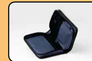
046V002 Carry Pouch SonicaidOne