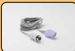
ACC-OBS-023 Qwik Connect FECG connection lead