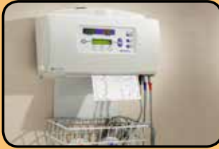
ACC31 Wall Bracket