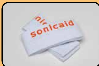
ACC220 Latex free- Disposable transducer belts (box of 100)