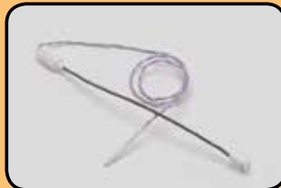
ACC-OBS-020 Copeland Fetal Scalp Electrode Qwik Connect (box of 25)