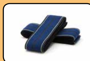
ACC-MI1136 Latex free Reusable transducer belts (pair)