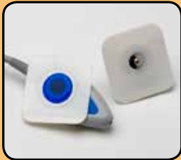
ACC900X260 Safelinc / Eziplug Reference Electrode