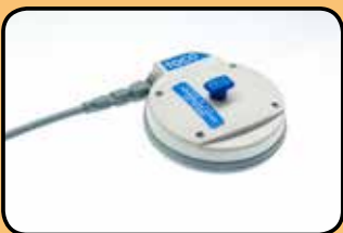
CT1 Contractions Transducer