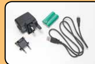
ACC226 Rechargeable medical grade kit (for digital SR Dopplers only)