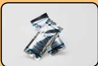
ACC-1300-0145 Aquasonic Gel 20gm sterile sachet (packs of 48)