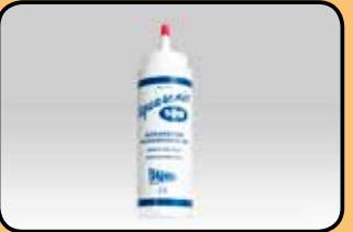
ACC3 Aquasonic Gel (box of 12x250ml)