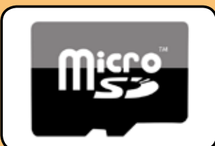
ACC227 Micro SD card - Digital SR Model Dopplers Only