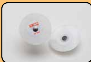
ACC-OBS-027 Philips Maternal ECG skin electrodes (Box of 300)