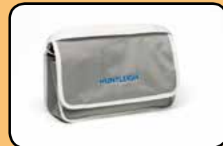
ACC34 Soft carry case