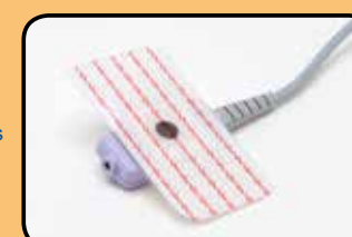
ACC-2464AA0 Qwik Connect Reference Electrodes (box of 50)