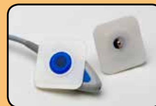
ACC-900X260 Safelinc/Eziplug reference electrodes (box of 50)