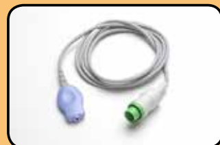
ACC OBS 068 FECG Leg Plate Adaptor, Quiwk Connect