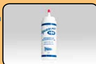
ACC3 (box of 12 x 250ml bottles)