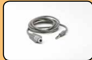
SP-7775-6901 Patient Event Marker