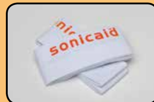
ACC220 Latex free disposable transducer belts (box of 100)