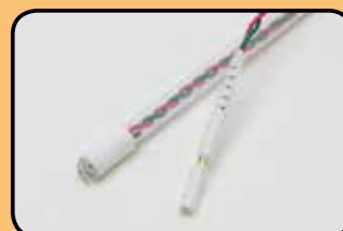
ACC-900X259 Safelinc Fetal ECG Spiral Electrode Single Helix (Box of 50)