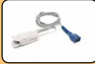
ACC-NEL-DS-100A Nellcor OxiMax SpO2 Durasensor DS1-100A