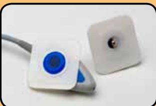
ACC-900X260 Safelinc/Eziplug reference Electrodes (box of 50)