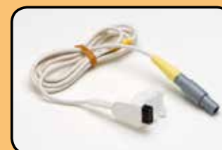
ACC-OBS-006 SPO2 Cable Connector (Plastic connector)