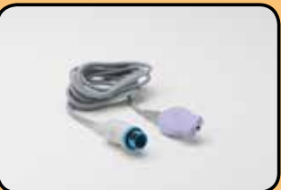
ACC-739087 Qwik Connect FECG connection lead (Team IP only)