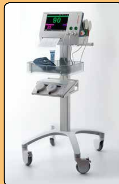
ACC-OBS-072 Team3 Stand