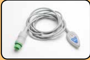
ACC OBS 066 FECG Leg Plate Adaptor, Safelinc