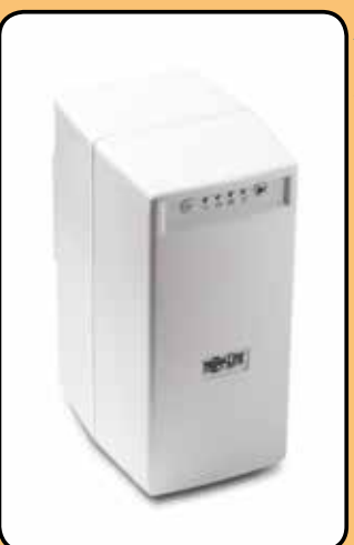
ACC-OBS-046 230V UPS Power Supply