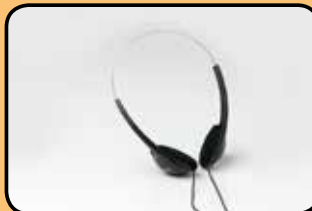
ACC21 Stereo Headphones