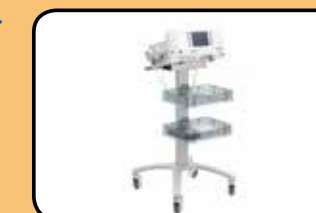
ACC-OBS-003 Fetal Monitor Trolley