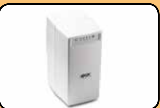
ACC-OBS-0046/047 Un-Interruptable power supply (UPS)- 230V/120V