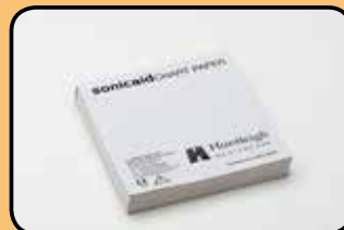
ACC-8400-8003 Standard grade chart paper (Box of 20 packs)