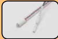
ACC900X259 Safelinc FECG Electrode