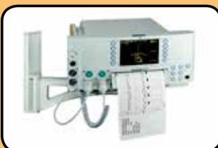
ACC223 FM800 series Universal Wall Bracket