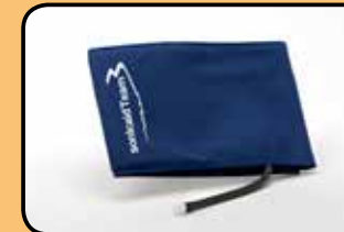
ACC OBS 073 Medium BP Cuff (24-32cm) ACC OBS 074 Large BP Cuff (32-42cm) ACC OBS 075 Extra Large BP Cuff (38-46cm)