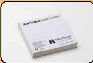
ACC-8400-8003 Standard grade chart paper (Box of 20 packs)