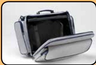
ACC30 Carry Case