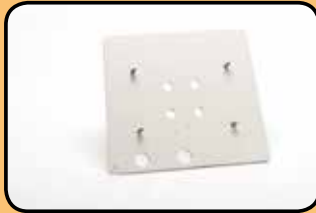
ACC -OBS 083 Trolley mounting Plate