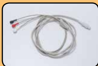
ACC-OBS-070 Team3 Maternal ECG lead (TEAM 3I models only)