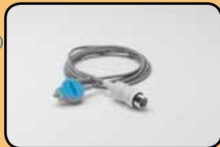
ACC-OBS-021 Eziplug FECG connection lead