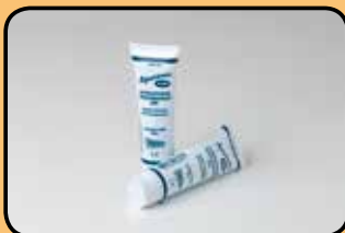
ACC-24 Ultrasound Gel (box of 12 x 60ml tube)