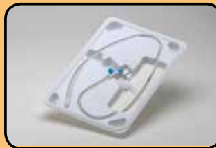
ACC-8400-8011 Intran Plus IUP catheter (box 10)

* Allows UPS to be trolley mounted - contact Customer Service department for model required.