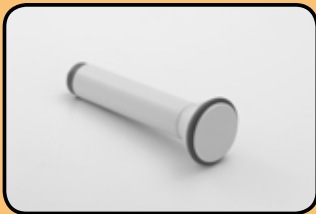
OP2XS 2MHz obstetric probe