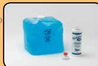
ACC-1500-0154 Aquasonic Gel 5ltr container (each)