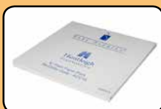
ACC15 Plain Paper Pack (box of 10)