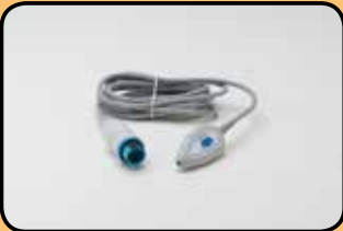
ACC- 017D065 Safelinc FECG connection lead (Team IP only)