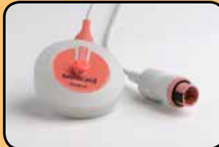
ACC-OBS-009 (2m length) Toco Transducer ACC-OBS-009L (3m length)