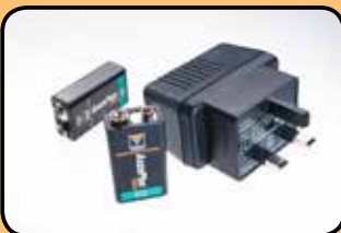
ACC171 (UK) Battery ChargeKit. ACC172 (USA) ACC173 (EU) European (D920/D930 / FD range Dopplers only)