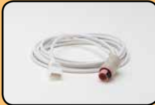
ACC-8400- 6937 Intran Plus(IUP) Interconnecting Lead (TeamIP only)