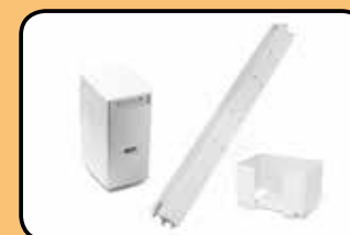
* ACC-OBS-061/063 ACC-OBS-060-062 with replacement central column