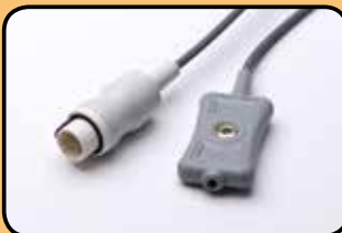
ACC-OBS-007 Philips Legplate adaptor cable.