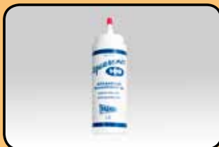
ACC3 Aquasonic Gel (box of 12x250ml)