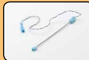
ACC-900X534 Eziplug FECG Copeland style electrode (box of 25)