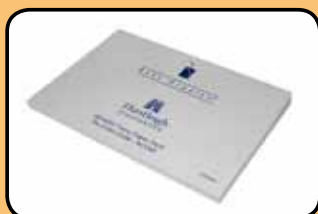
ACC66 Twins Paper Pack (box of 10)