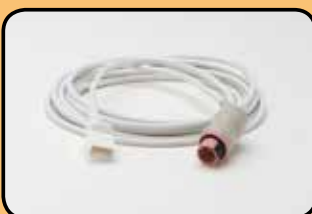
ACC-8400-6937 Team3 IUP Intra Plus Interconnection lead for Intrauterine Pressure monitoring (TEAM 3I models only)