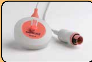
ACC-OBS-009/009L Toco Transducer pink 2metres/3metres (3m length)