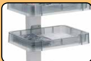
ACC-OBS-048 Trolley tray