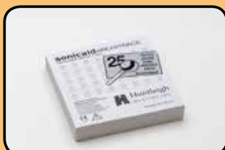
ACC-321414 Architrace 25 year archival chart paper (Box of 20 Packs)