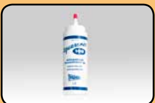
ACC3 Aquasonic Gel- (box of 12 x 250ml bottles)