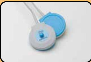
8400-6920 2MHz (2m length) Ultrasound Transducer Blue 8400-6920L 2MHz (2.8m length) Ultrasound Transducer