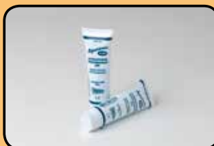
ACC-24 Aquasonic Gel- (box of 12 x 60ml tube)