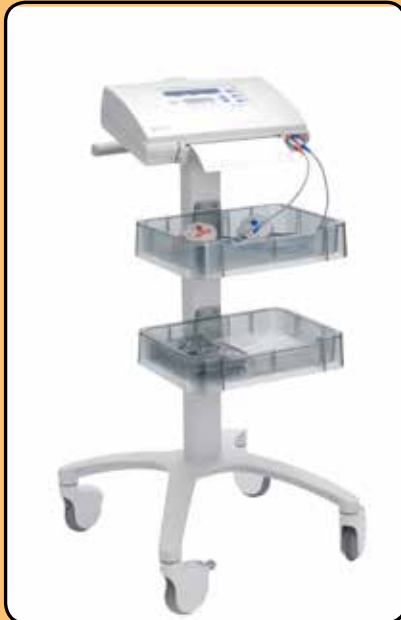
ACC-OBS-004 BD4000 Stand