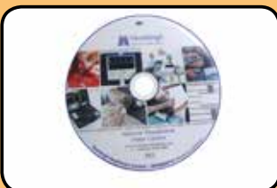
CD-Sound Library of sounds CD