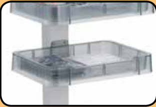
ACC-OBS-048 Trolley tray