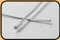
ACC-700AA0 Spiral Fetal ECG Electrode