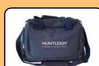
ACC-OBS-091 TEAM3 Carry Bag