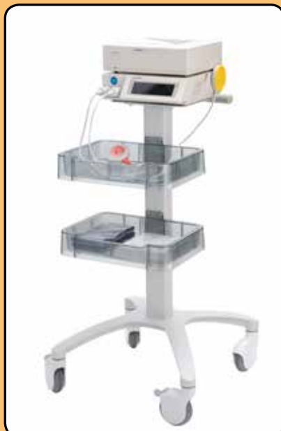
ACC-OBS-002 Team Stand