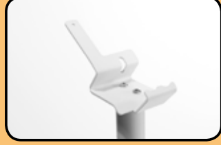
ACC52-2 Doppler stand (SR Digital Doppler Range only)