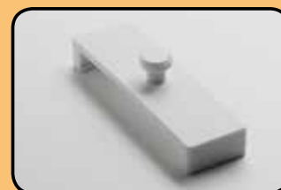
ACC-OBS-051 (pack of 5 Pairs)