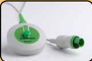
ACC-OBS-008 (2m length) 1 MHz Ultrasound Transducer ACC-OBS-008L (3m length)