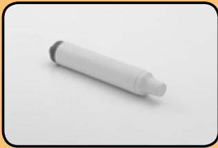
VP5XS 5MHz Vascular probe -audio only