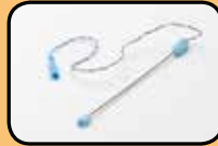
ACC900X534 Eziplug / Copeland style FECG Electrode