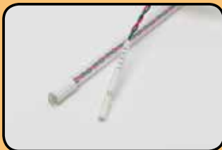
ACC-900X259 Safelinc fetal spiral electrode Single Helical (Box of 50)