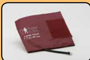
ACC-MI1184 Large Adult BP cuff 31-40cm