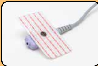
ACC-2464AA0 Qwik Connect Reference Electrodes (box of 50)