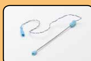
ACC-900X534 Eziplug FECG Copeland style electrodes (box of 25)