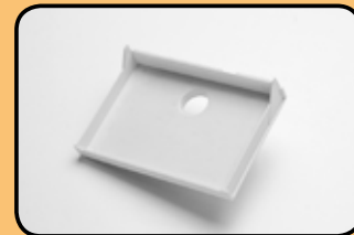
ACC-OBS-077 Paper Tray - Phillips ACC-OBS-078 Paper Tray - Corometrics (GE) ACC-OBS-079 Paper Tray - Huntleigh