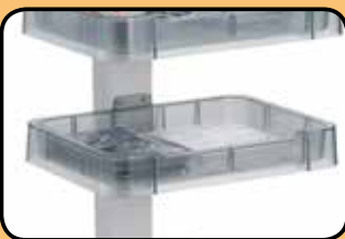
ACC-OBS- 048 Trolley tray