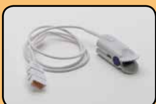
ACC-VSM-171 comfort clip finger sensor BCI Reusable SPO2 sensor