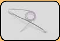
ACC-OBS-020 Copeland Fetal ECG Electrode