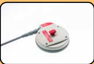
US1 Ultrasound Transducer