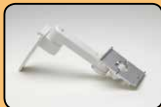
ACC-OBS-076 Team3 Universal wallmount