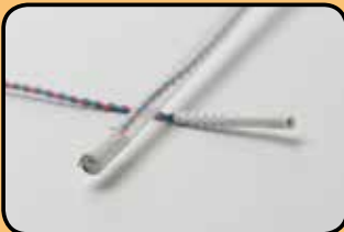
ACC-7000AA0 Qwik Connect Spiral Electrodes Single Helix (box of 50)