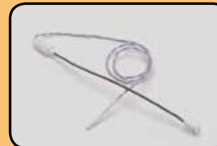
ACC-OBS-020 Copeland Fetal Scalp Electrode Qwik Connect