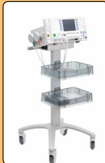
ACC-OBS-003 FM800 & FM800E Stand