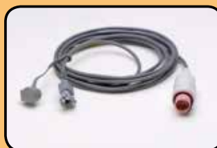
ACC-OBS-032 Team3/IUP Koala Interconnection lead for Intrauterine Pressure monitoring (TEAM 3I models only)