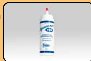
ACC3 (box of 12 x 250ml bottles)