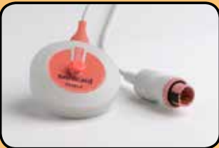
ACC- OBS-009 (2m length) Toco Transducer ACC-OBS- 009L (3m length)