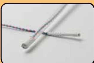
ACC-700AA0 Qwik Connect FECG Spiral Electrodes Single Helical (box of 50)