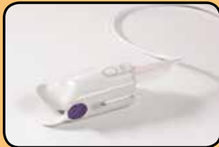
ACC VSM 171 Comfort Clip Finger SpO2 Sensor - BCI re-useable sensor