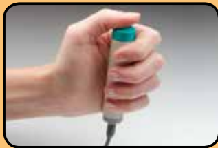
EM1 Patient Event Marker