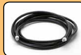
ACC-MI160 Hose for cuff