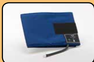
ACC-MI1159 Adult cuff 23 - 33cm