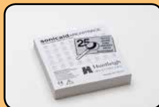
ACC-321414 Architrace 25 year archival chart paper (Box of 20 Packs)