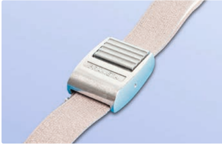
REF. 70.901.00.001 | The grey tourniquet