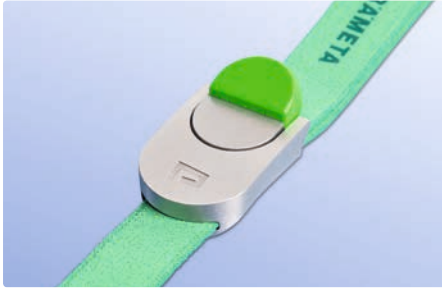
REF. 70.902.00.001 | The green tourniquet