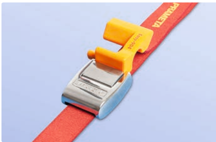
REF. 70.904.00.001 | The Easy tourniquet