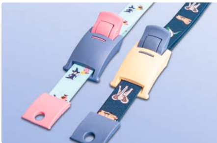
REF. Magic 70.906.00.004 | REF. Zoo 70.906.00.025 The Magic+Zoo tourniquet