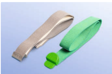
Spare straps for Prämeta tourniquets