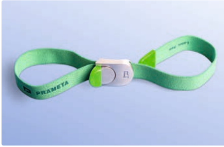
The green tourniquet – proven millions of times