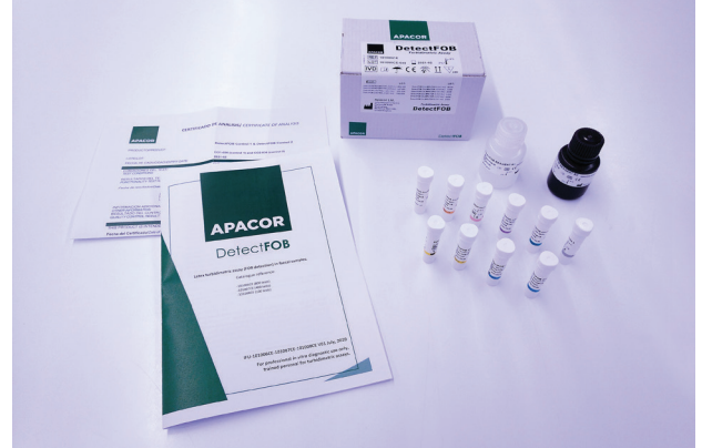
Presentation of DetectFOB reagents.

APACOR DetectFOB is a non-invasive immunological tests which can be used in a simple and effective manner in bowel cancer screening and confirmatory test.