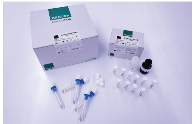
Presentation of DetectFOB reagents, and sampling vials box.