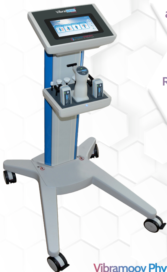
Vibramoov Physio Pack