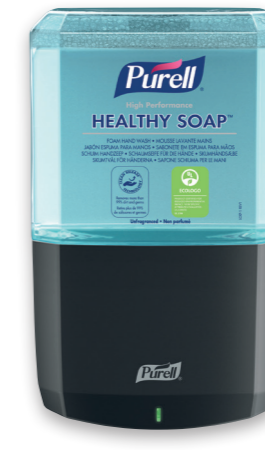
PURELL ES6 TOUCH-FREE

Durable and reliable manual systems. Easy to maintain.