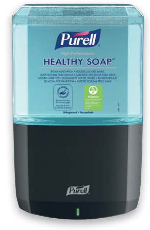
PURELL ES8 TOUCH-FREE, ENERGY-ON-THE-REFILL AND SMARTLINK™ CAPABILITY

Touch-free systems built for reliable performance and maintenance ease.