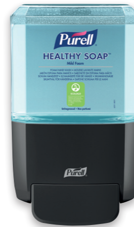
PURELL ES4 MANUAL

Durable and reliable manual systems. Easy to maintain.