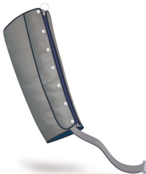
Twelve Chamber Arm Garment