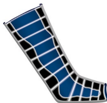
Twelve Overlapping Chambers